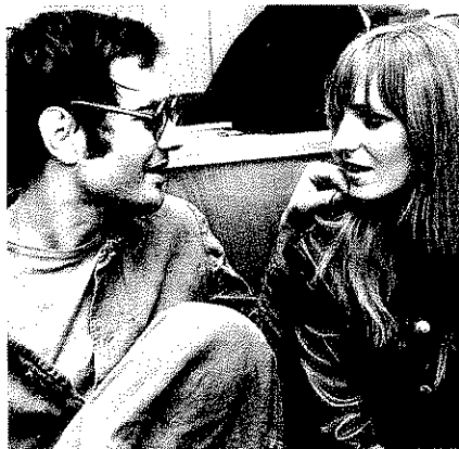
Terrorists Baader, Ensslin

Two department stores in Frankfurt are targeted with arson attacks. The perpetrators include Andreas Baader and Gudrun Ensslin, who go on to lead the self-proclaimed Red Army Faction (RAF).