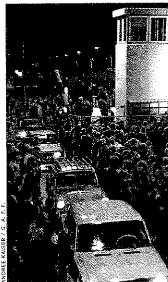
Berlin after the fall of the Wall

At the Monday demonstration in Leipzig, the demand for the two German states to be reunified is voiced for the first time: "We are one people."