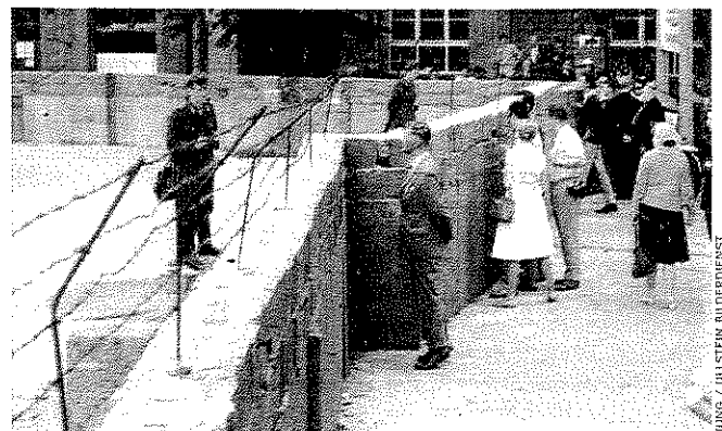
Newly-built section of the Berlin Wall

Workers begin building the Berlin Wall, which will divide East and West Berlin for nearly 30 years. Until now, hundreds of thousands of East Germans had escaped to the