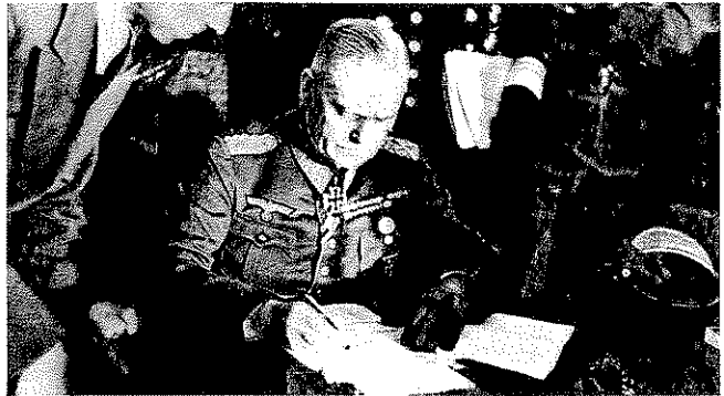
Wehrmacht Commander Keitel

From unconditional surrender to record unemployment, East Germany's birth to its demise: a timeline of German postwar history