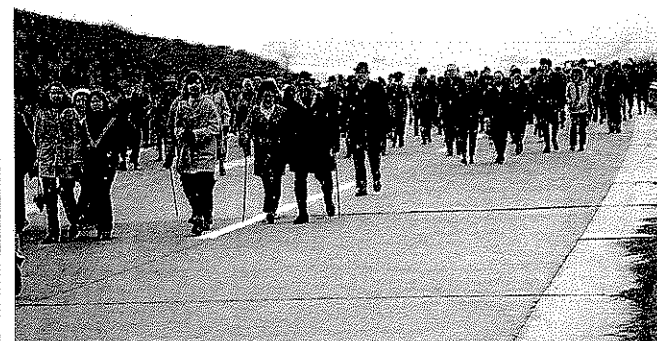
Strolling on a car-free Sunday

German autobahns remain empty. The Arab states' oil boycott forces the industrialized countries to impose drastic saving measures. West Germany prohibits driving on four Sundays during the year.