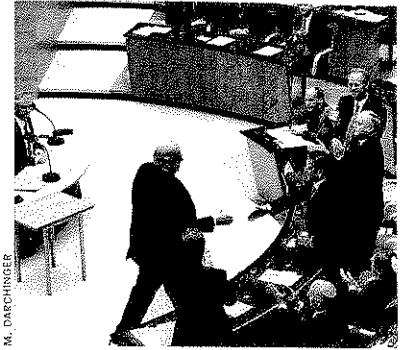
Kohl, Schröder in the Bundestag

The coalition of Christian Democrats and Free Democrats led by Helmut Kohl suffers a conclusive defeat in the general elections. The chancellor of reunification steps off the political stage, to be succeeded by the Social Democrat Gerhard Schröder.