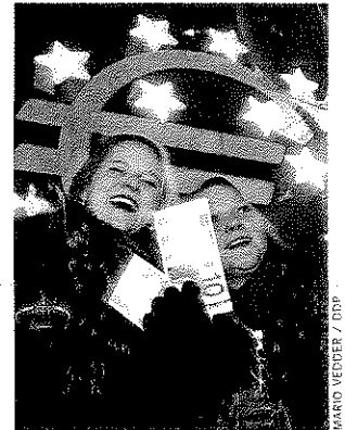
Euro festival in Frankfurt

At the convention of Berlin's Social Democrats, Klaus Wowereit, his party's leading candidate for the office of governing mayor, says he is a homosexual. His statement – "I am gay, and that's a good thing" – becomes a popular expression. Berliners have no problems with his sexual orientation and elect him to office.