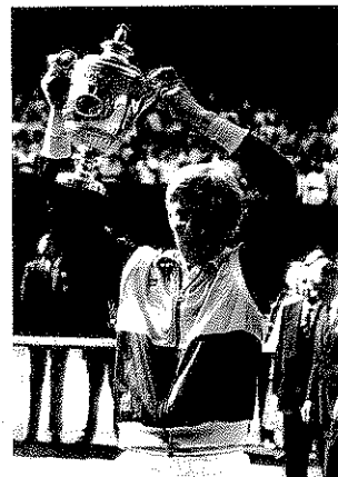
Wimbledon great Becker

The 17-year-old Boris Becker from Leimen is the first German, and youngest player of all time, to win Wimbledon – the world's top tennis tournament. Germany finds itself in the grips of a collective tennis craze.