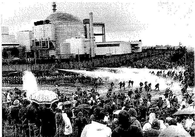
Demonstration against the Brokdorf nuclear power plant (1986)

Some 90,000 anti-nuclear campaigners clash with thousands of police officers at a demonstration against the Brokdorf nuclear power plant. From the Brokdorf power plant through the confrontations at the western runway at Frankfurt Airport to occupied buildings in Hamburg, Frankfurt and West Berlin, West German political protests increasingly degenerate into civil disorder.